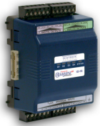
EC-Net AX IO-16