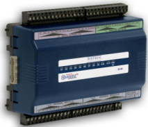
EC-Net AX IO-34